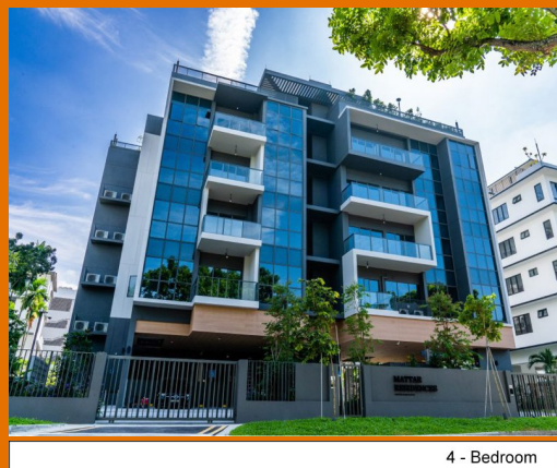
TYPE D1a #03-03 TYPE D1c